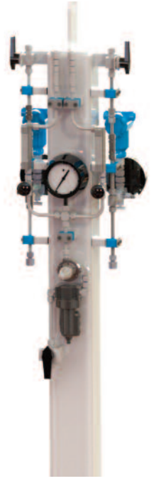
Stand Mounted Dual 72/76