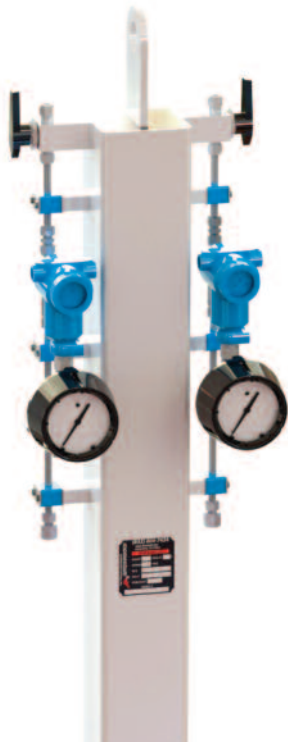
Stand Mounted Dual 76